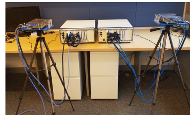
Figure 1: Two X60 nodes, each attached to a SiBeam phased array module.

This poster introduces X60 , the first highly configurable software defined radio (SDR) 60 GHz testbed, featuring fully programmable PHY, MAC, and Network layers, ultra-wide channels, and phased arrays. Based on the National Instrument's (NI) millimeter-wave (mmWave) Transceiver System [3] and equipped with user-configurable 12-element phased array antennas from SiBeam, X60 nodes (Figure 1) enable communication over 2 GHz wide channels using